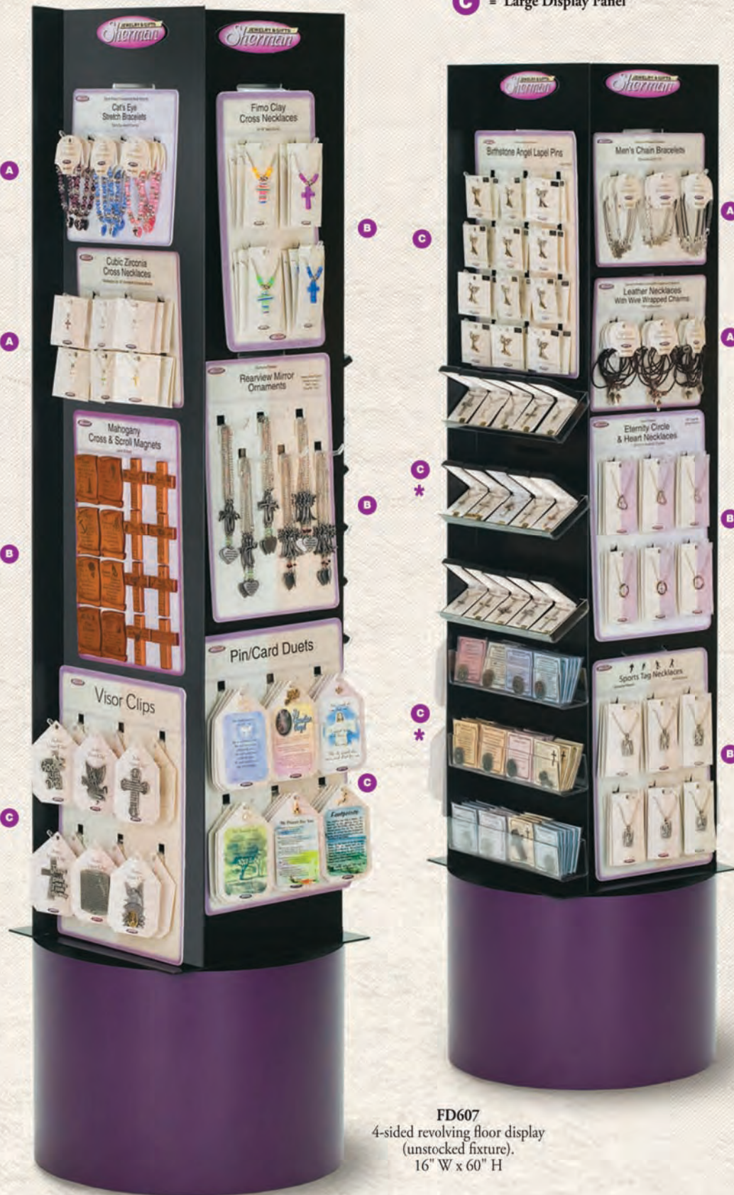
FD607 4-sided revolving floor display (unstocked fixture). 16" W x 60" H