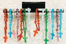
DA14 Bracket for hanging products (unstocked).